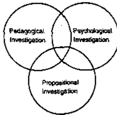
Figure 1. Doing mathematics in our teacher group involves three types of investigations: psychological, pedagogical, and propositional 7

In the IMT group, doing mathematics emerges through teachers investigating their own mathematics teaching. 6 When doing mathematics , members conduct three types of investigations: pedagogical, psychological, and propositional. In this context, the members of the group construct pedagogical, psychological, and propositional knowledge as they inquire into mathematical situations which they bring from their classrooms. Their investigations enable them to construct knowledge: how to structure learning opportunities, how children think and reason, and how mathematics works. The following figure represents the authors' current thinking about the relationship among the investigations which we see as doing mathematics in this context.